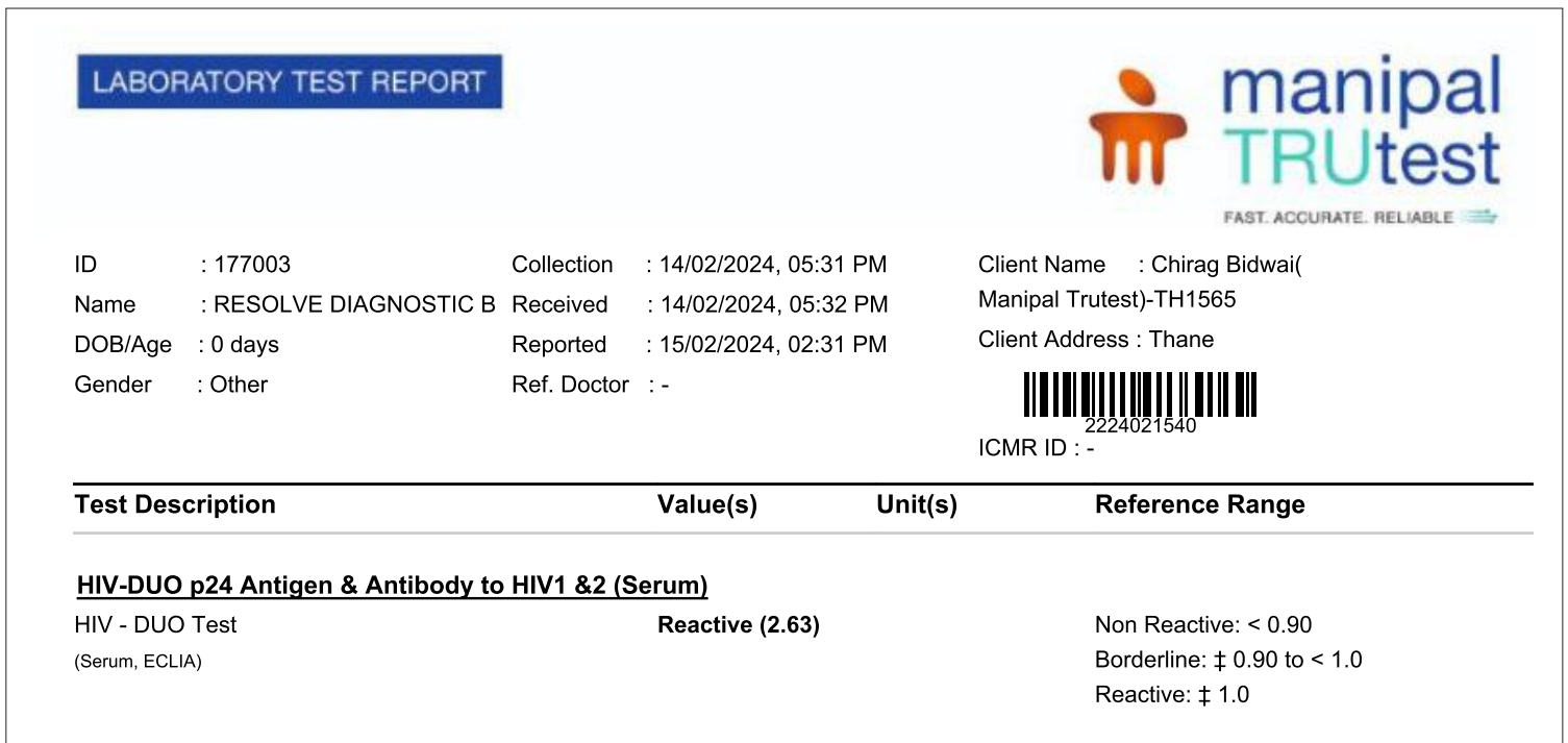
Figure 2: Reports from Manipal TRUtest for Resolve's Recombinant HIV-1 p24 samples spiked in FBS and diluted to (A) 200 pg/mL (20 IU/mL): COI 20.76; and (B) 20 pg/mL (2 IU/mL): COI 2.63

Note 4 : 1.0 IU/mL of HIV-1 p24 is estimated as 10.0 pg/mL